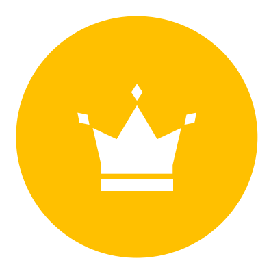
RECOMMENDATION OF KINGS FUND & INTENSIVE CARE SOCIETY