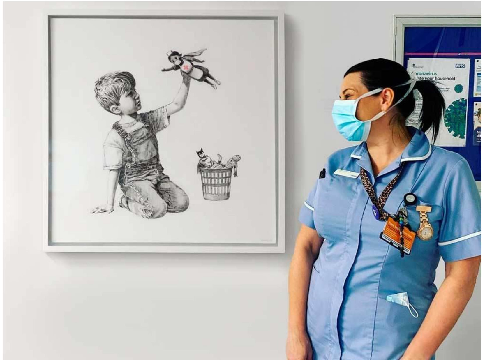
Banksy (2020) Game Changer . [Wall Muriel] Southampton General Hospital.