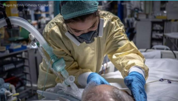
An intensive care nurse treats a patient who is on a ventilator.

'I will never forget... One patient that broken many... of us. She was she was a colleague. She, she worked in a different hospital... And then she came to us with COVID. She was very young.' AoC04