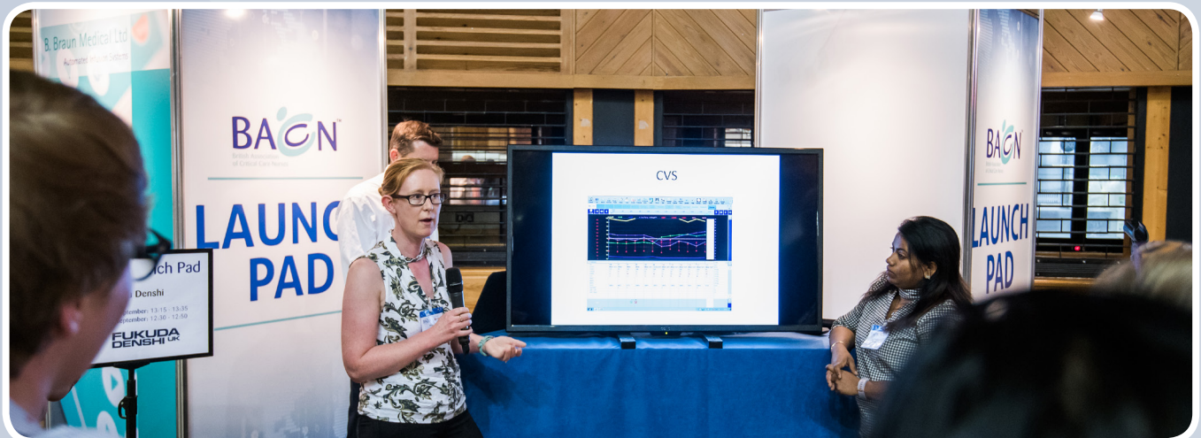
Launch Pad 2018

Delegates who are more visual or hands on learners often need to see your product in action to fully grasp its value and potential. The ability to see and feel your product or treatment is generally more appealing to purchasing staff than simply listening to your pitch.